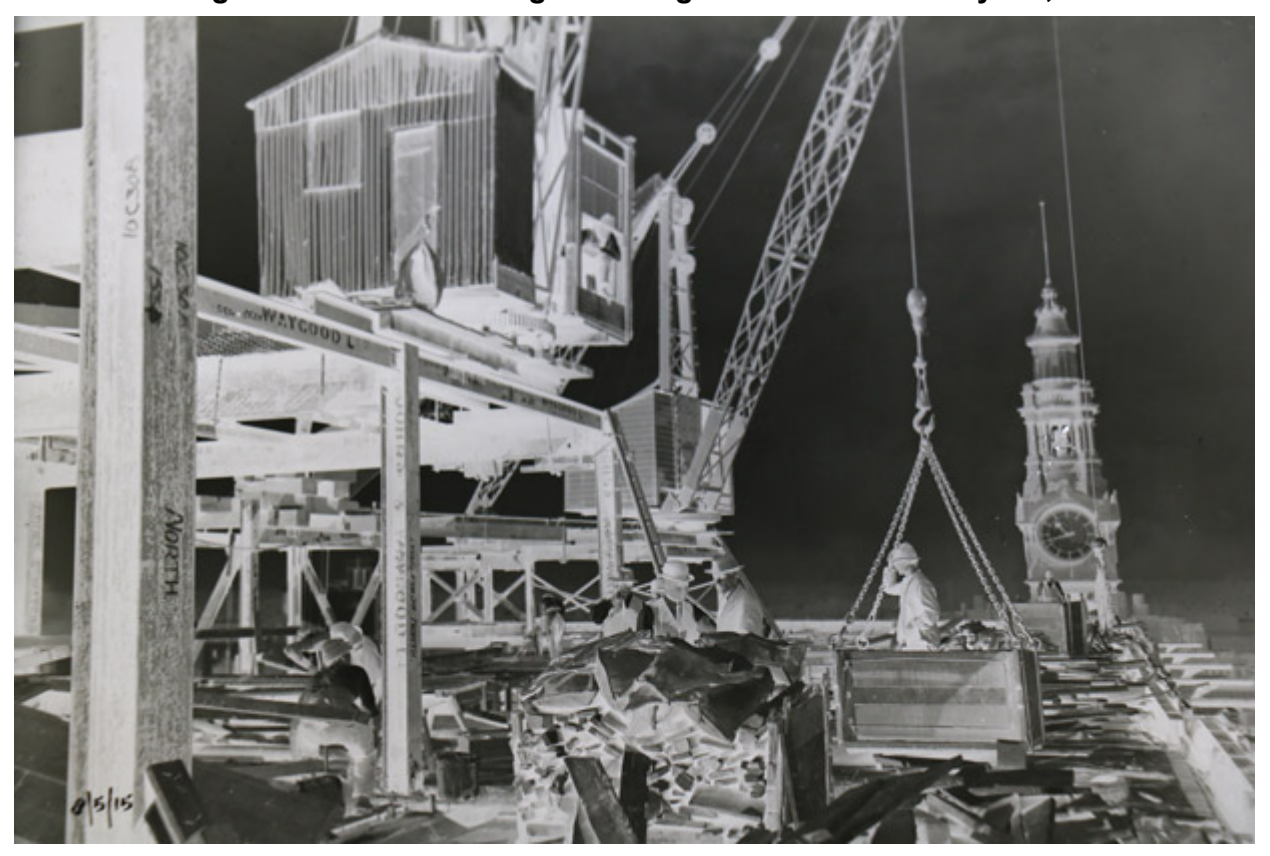
Figure 3: Glass Plate Negative Image of Martin Place Skyline, 1915

Commonwealth Bank Head Office, corner of Pitt Street and Martin Place (Moore Street), roof construction on 8 May 1915.