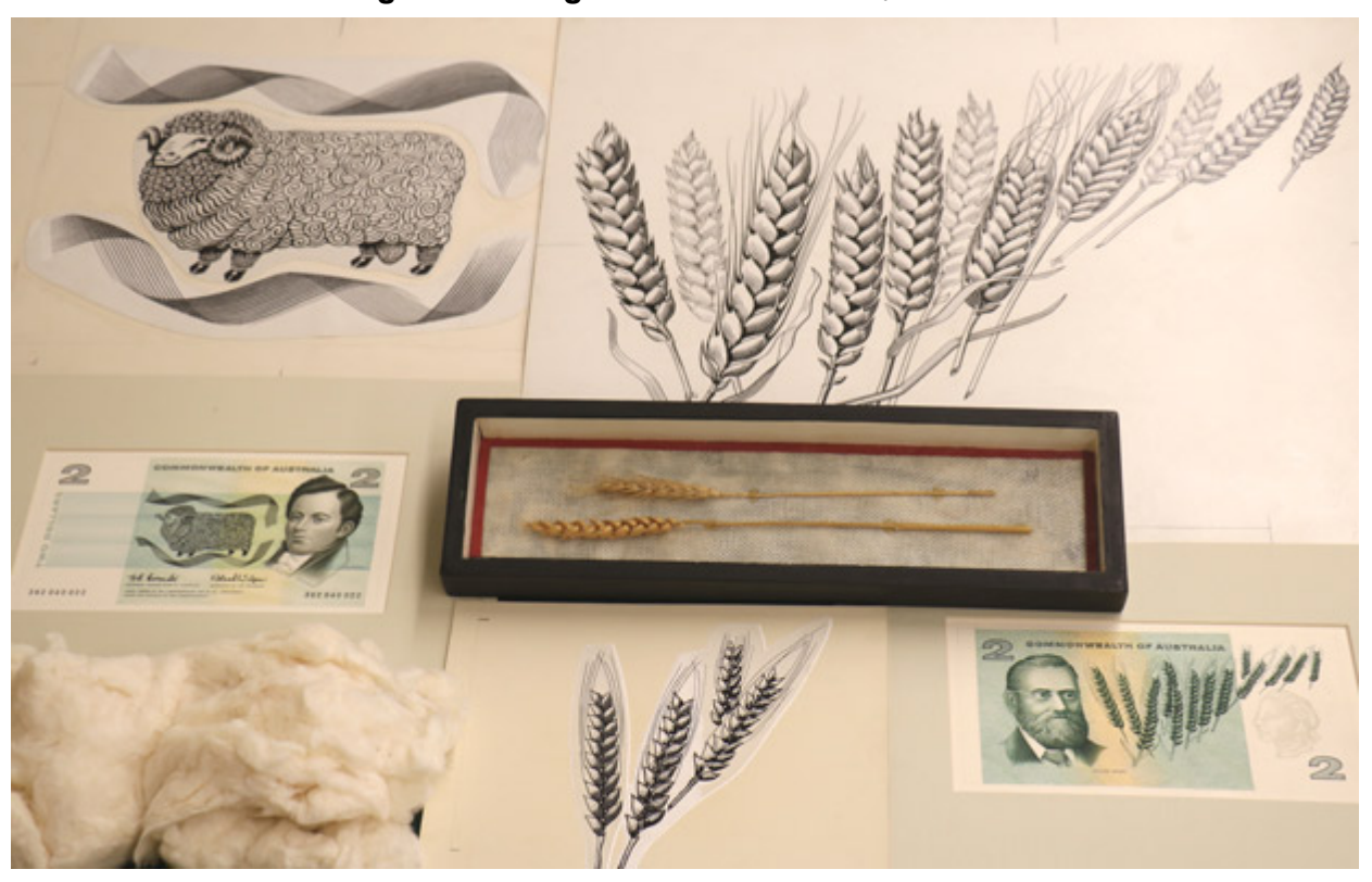
Figure 4: Design Elements for the $2 Banknote

Banknote design elements by Gordon Andrews, including original wool and wheat used to create images on the $2 banknote, along with early design concepts for the banknote.